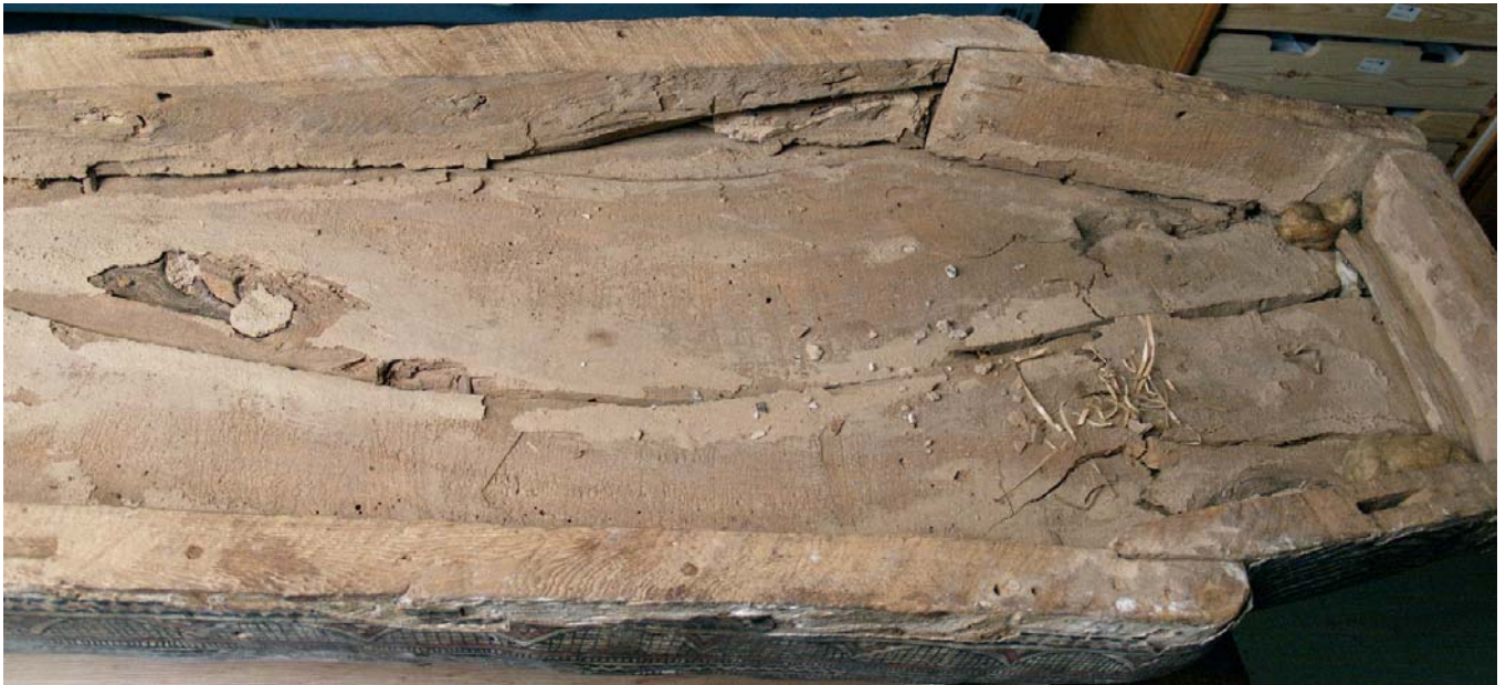
Figure 3. H4308: underside, showing cracking.

appreciated and will have a lasting effect through continued use of the books and vacuum cushion on numerous other projects and the safe display of a newly stabilised H4308 in the gallery. The Conservation Department would also like to extend a special welcome to Society members to attend 'Putting Egypt on Display', a public conservation event which will focus on the work being done to prepare the Egyptian objects. Please do come to this event (Saturday, November 18 from 10:00 a.m. to 3:30 p.m.), where you can see some of the conservation techniques firsthand and talk to the conservators about their work.