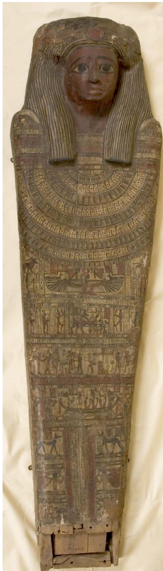
Fig. 2. The coffin lid of the Gatekeeper of the Temple of Hathor, Peditehuty, son of Horbebny and Meresmut, probably dating to the second or first century BC; numbered H4308, it came to the museum in 1922 as the gift of J.F. Hollway (D. Emenev)

The support of the ESB for the preservation of the Museum's Egyptian collections is greatly