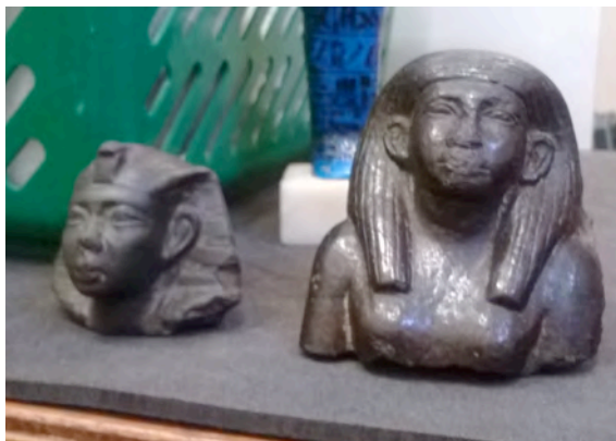
Below Two heads from the Middle Kingdom

were able to visit the storage rooms for organic materials and human remains, highlighting some of the challenges of conservation and the issues that surround the ethics of caring for human remains. The groups then moved to a further storeroom where we were privileged to have a very close look at a fine faience shabti of Panedjem II, two small Middle Kingdom sculptures (complete with Senwosret style large ears!) However, the behind the scenes tour finished off in style, with a chance to hold an ivory object that formed part of the harness, most probably from the royal chariot of Amenhotep II himself!