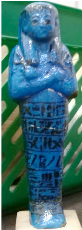
Left Shabti of the High Priest of Amun, Panedjem II, from the Royal Cache (TT320) near Deir el-Bahari.