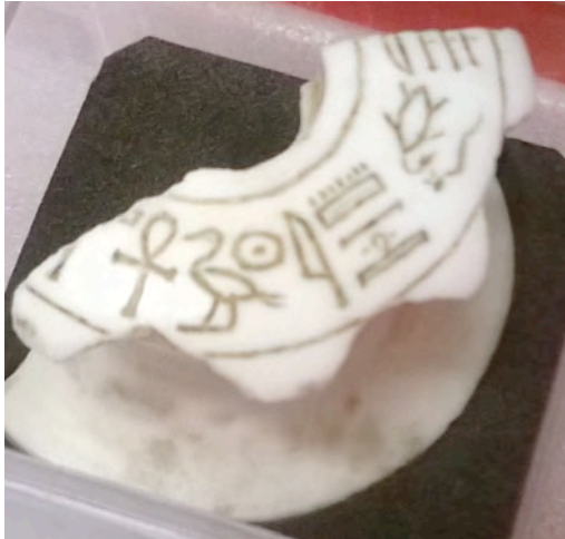
Above A fragment of ivory harness, bearing the name of a King Amenhotep.

differences, suggesting different fathers, or that perhaps Nakhtankh was adopted.