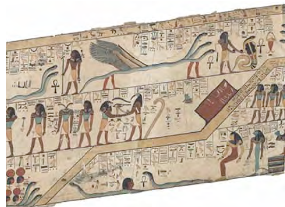
Watercolour of part of the tomb of Sethy I (showing the wall of one of the sloping passages).

In the Egypt Gallery, we now have audio guides called 'DiscoveryPENS'. They're aimed at visually impaired people but anyone who wants to use one can borrow a 'pen' from rece-