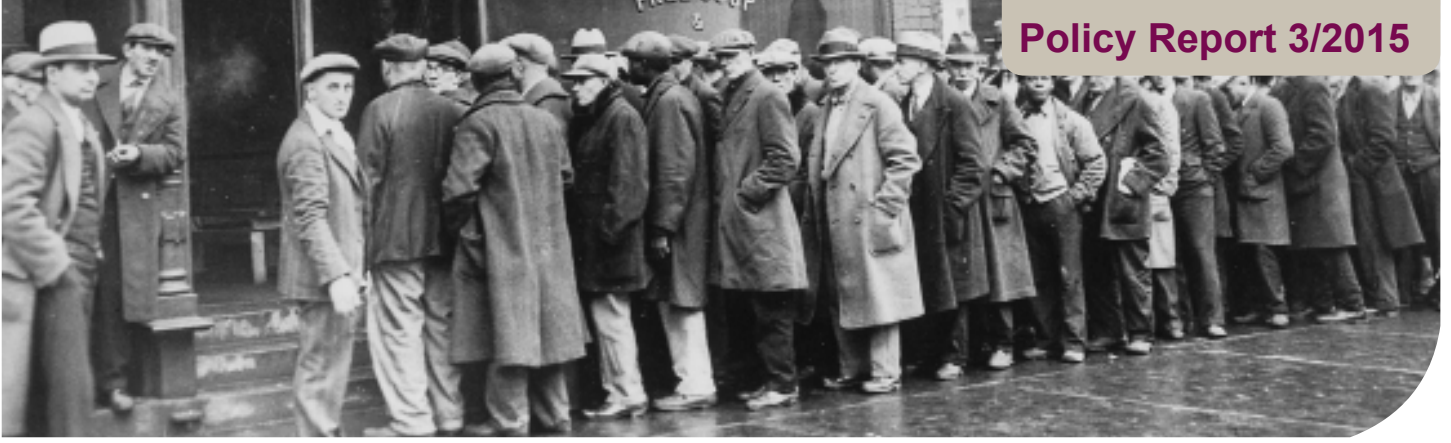
Image by unknown author (U.S. National Archives and Records Administration)