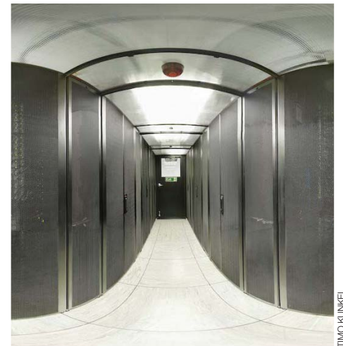
Top: Graduate School of Education library Bottom: The University's High Performance Computing facility